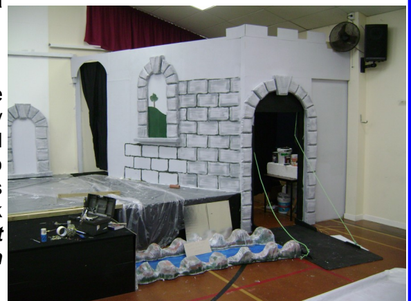
The set for the Production starting to take shape