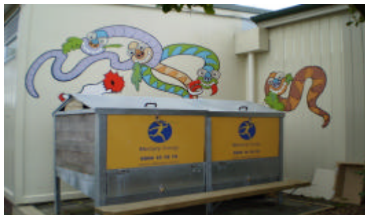
Our worms eat lots of food scraps and produce "Worm Tea" for our garden. This helps to reduce the amount of rubbish we have at school .

Our school banking day is on a Tuesday and the children are to post their banking in Kashin the elephant, which is in the office, before school (deposit envelopes are also on the Kashin stand). For security reasons, we encourage you to bring their money on a school banking day only. ASB are currently processing the children's application forms and they should be able to