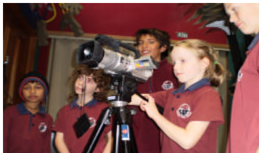
One of our many professional teams presenting MVTV.

Learning is lots of fun at Marina View School!