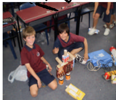
Children from Room 22 enjoying making their own robots.