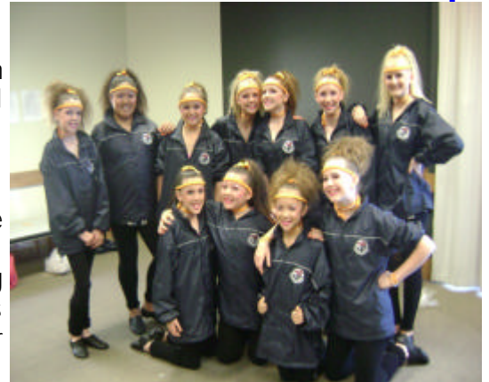
Our lovely Jump Jam team