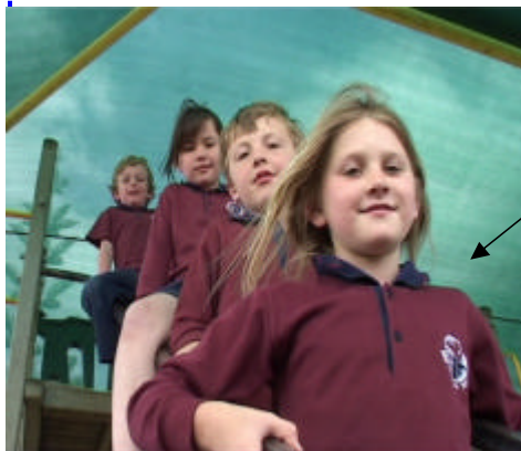
Year 2 Students made an Advert for our School Magazine.