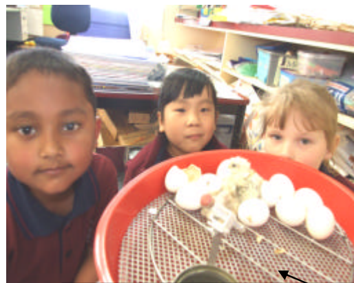
Some of our little children watching baby chicks hatching

They looked like flying gold coins, silver snow flakes and bronze birds, falling from the sky.