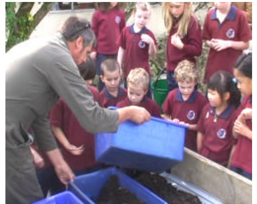
Our little pupils studying the worm farm—we now have lots of worm juice to help the gardens grow.....