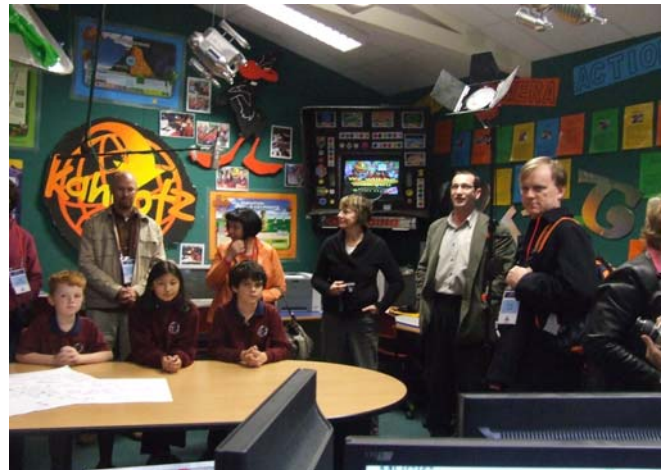
MVTV Show demonstrated to Australian Teachers by our Mvtv Crew