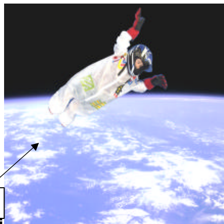
Hunter flying through space