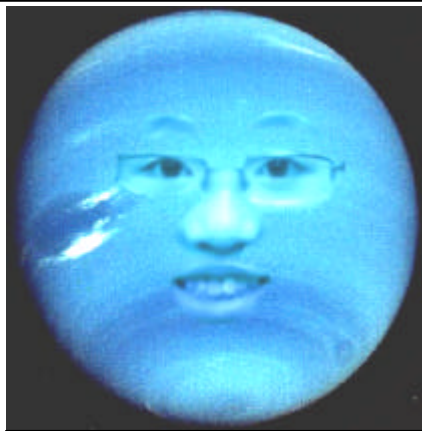
The ‘Man in the Moon’ ?