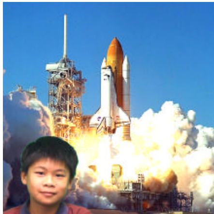
Guyver at the shuttle take-off!!

Ashley ‘the sun goes to bed in another town when it is sunset.’