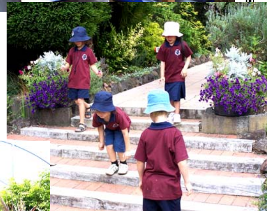
Our five year olds visited the Butterfly House in New Lynn recently. They enjoyed the gardens and did some very good work about the development of a caterpillar to a butterfly.