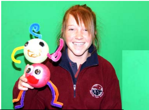
We see a Rocket and some of the Space Creatures which the Intermediate students made. These will be used on MVTV and filmed as part of their Space Study Project.