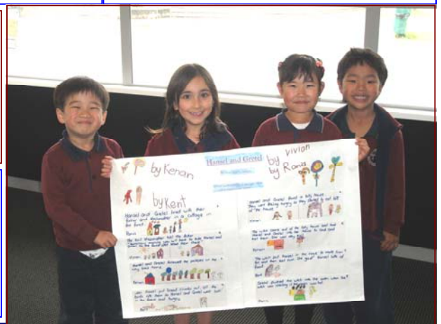
Front Page and Left: Examples of our wonderful artwork on display this week.