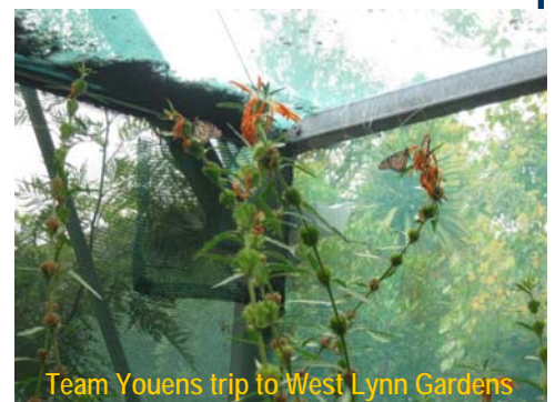
Team Youens trip to West Lynn Gardens