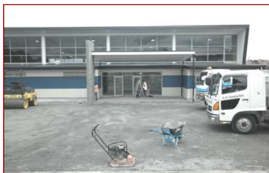
MVS Gymnasium nearing completion