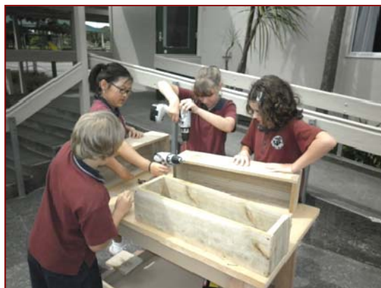
Year 7/8 students at 'Technology' lesson