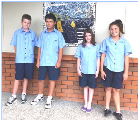
Samples of the proposed new shirts for our Year 7/8 students

The first PTA meeting for 2011 will be held on Thursday 3rd March at 3.15pm in the school Staffroom EVERYONE IS WELCOME