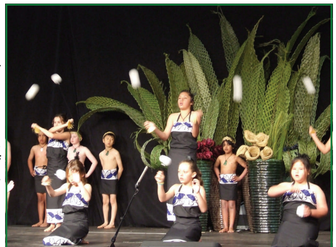
Our Kapa Haka group performing at the West Auckland Multicultural Festival at Corban's Arts Centre