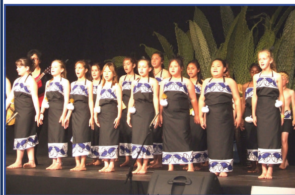
Our Kapa Haka group performing at the Waitakere Schools' Multicultural Festival