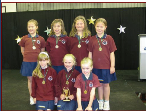
Our Year 3 'Rockets' Netball team who placed 1st in their grade. Well done!!