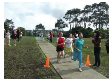
Cross Country—Year 4-6