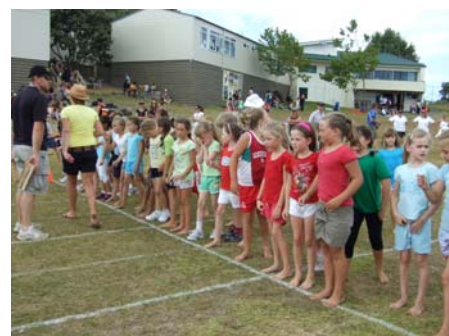
JUNIOR SCHOOL ATHLETICS DAY