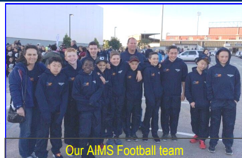
Our AIMS Football team