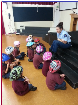
Scooter training day for our Year 1 children

The Performance.net developing Skills for Life...for kids