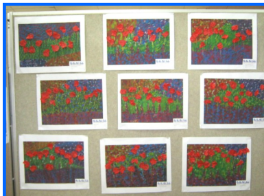
Artwork from our Exhibition