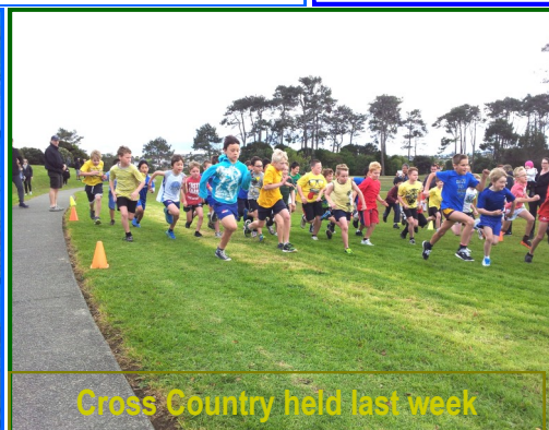
Cross Country held last week