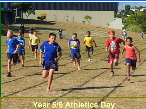
Year 5/6 Athletics Day

If you wish your child to take part in this competition, you will have received a letter outlining the dates of the tests, and the payments. Copies of the letter are available from the office. Closing date for entries is Friday 12th April. (No exceptions). Please send payment in an envelope to the office.